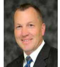
Rod Dolph Hy-Vee Food Stores, Inc.