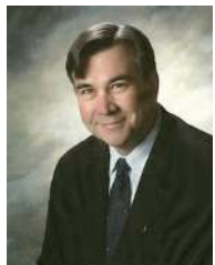
Dr. Gary Clapp Innovation Stockyard