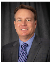
Stet Schanze Gray Manufacturing Co. Inc.