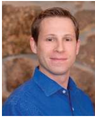
Rall Bradley News-Press NOW